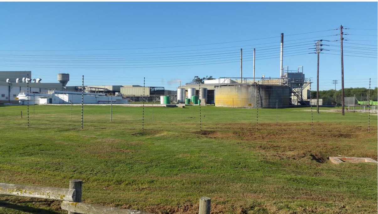
Photo 10: Abattoir expansion area and upgrade of rendering facility