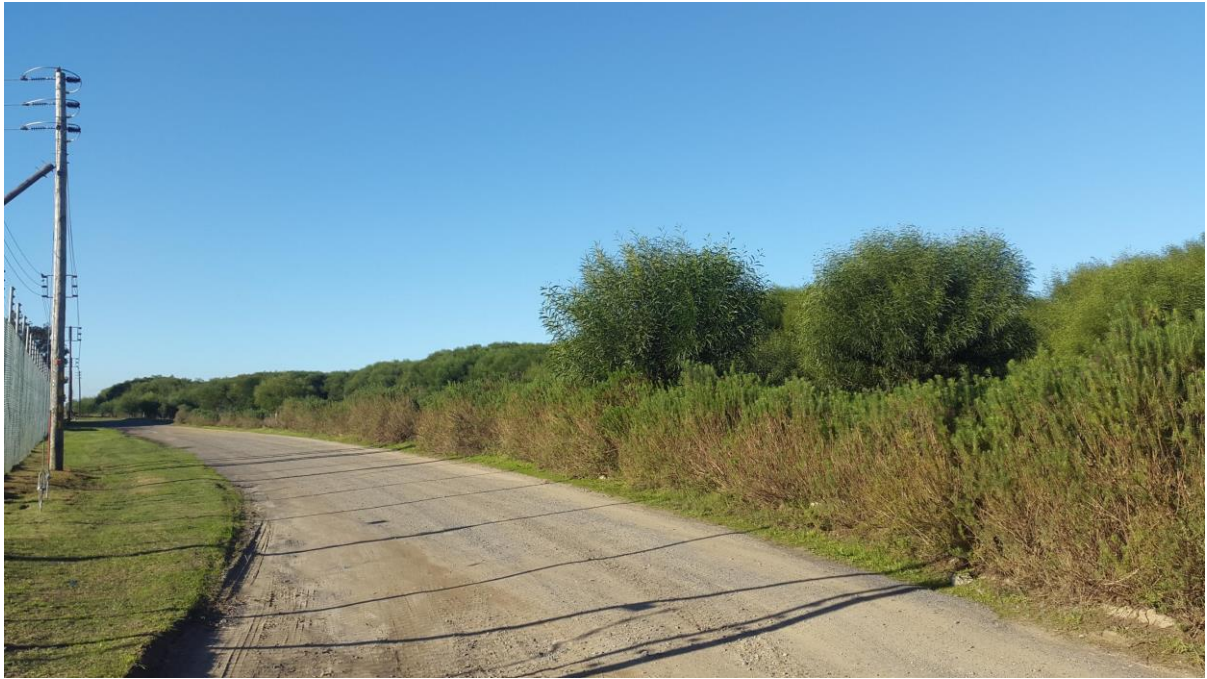
Photo 1: Abattoir and rendering facility southern boundary and land use