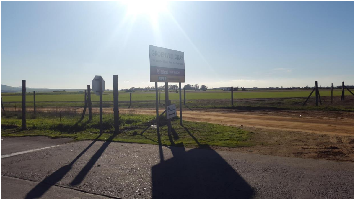
Photo 3: Abattoir and rendering facility northern boundary and land use