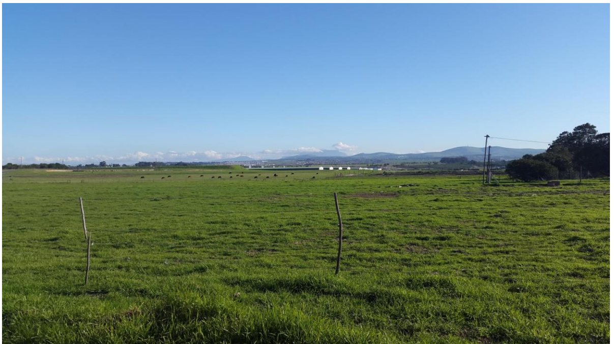
Photo 2: Abattoir and rendering facility western boundary and land use