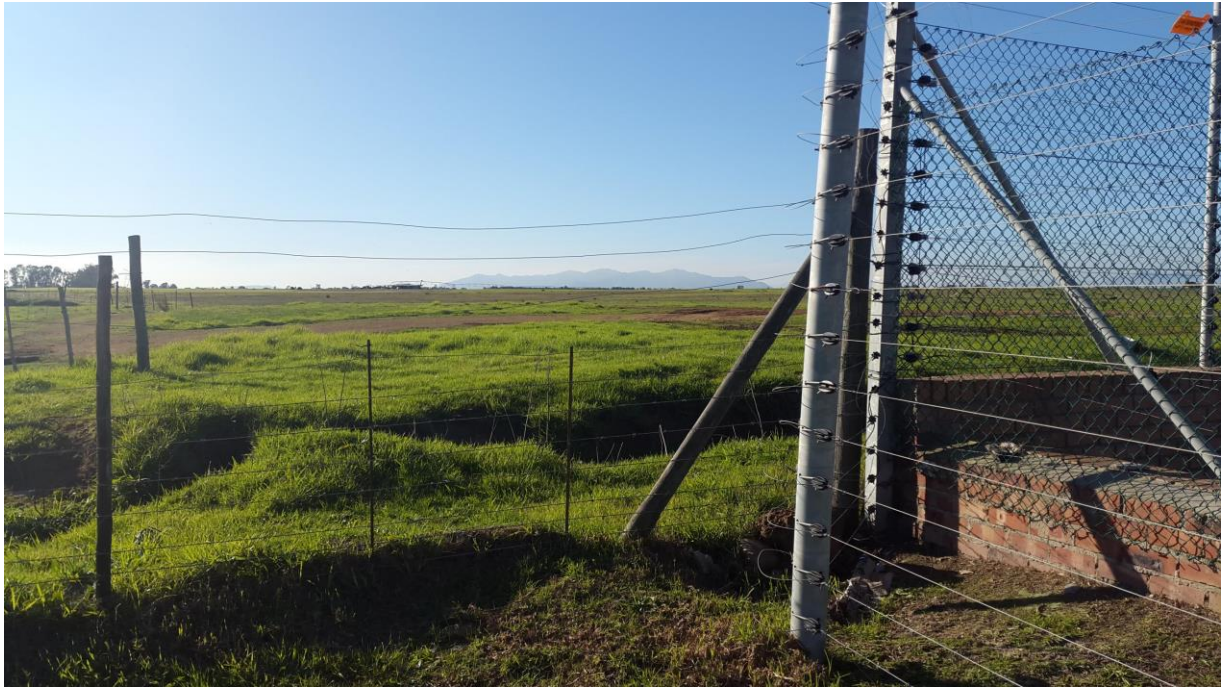
Photo 5: Abattoir and rendering facility northern boundary and land use