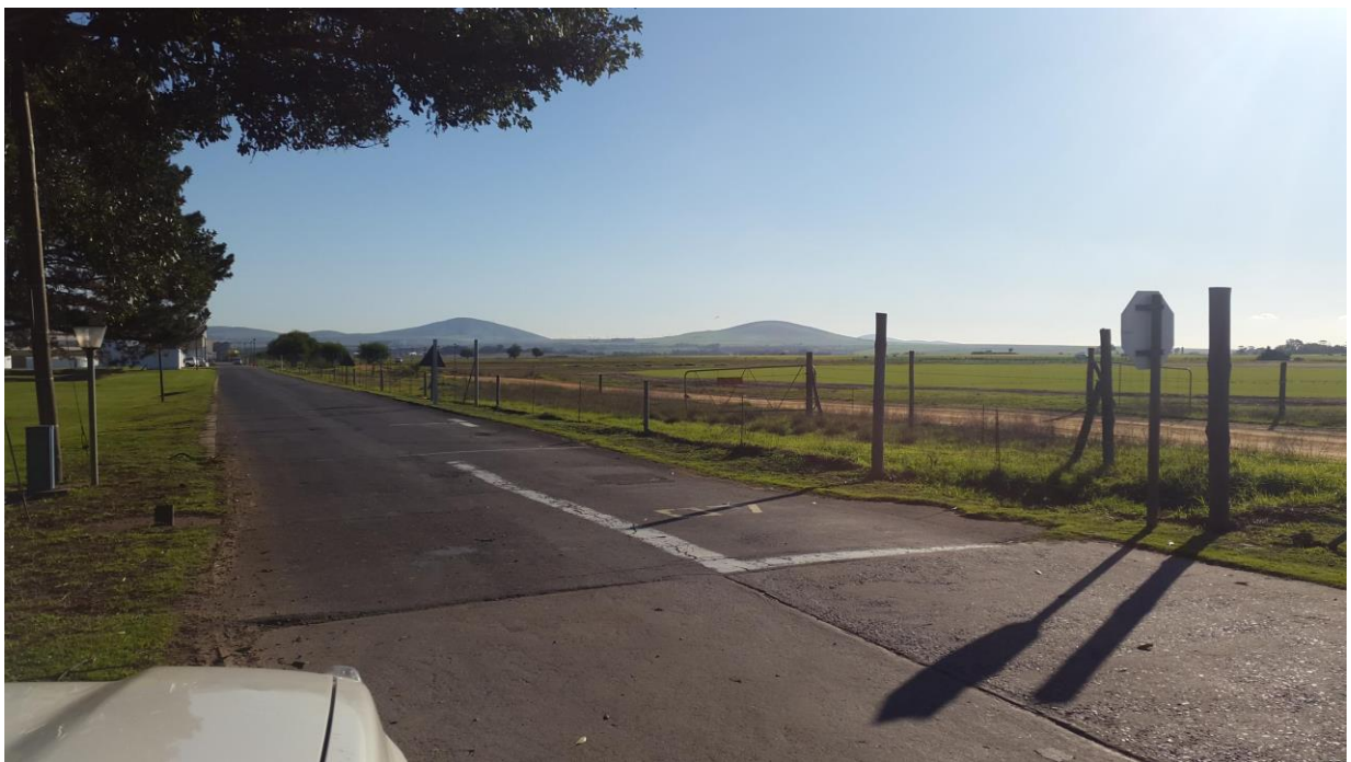
Photo 4: Abattoir and rendering facility northern boundary and land use