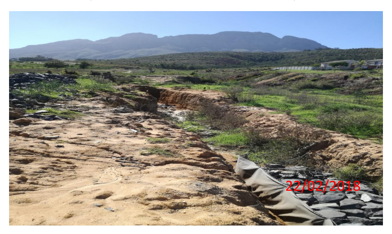
Photo 7: After: End of completed Gabion. Area with excavation (half-completed gabion construction). Picture taken from south in a north-easterly direction.