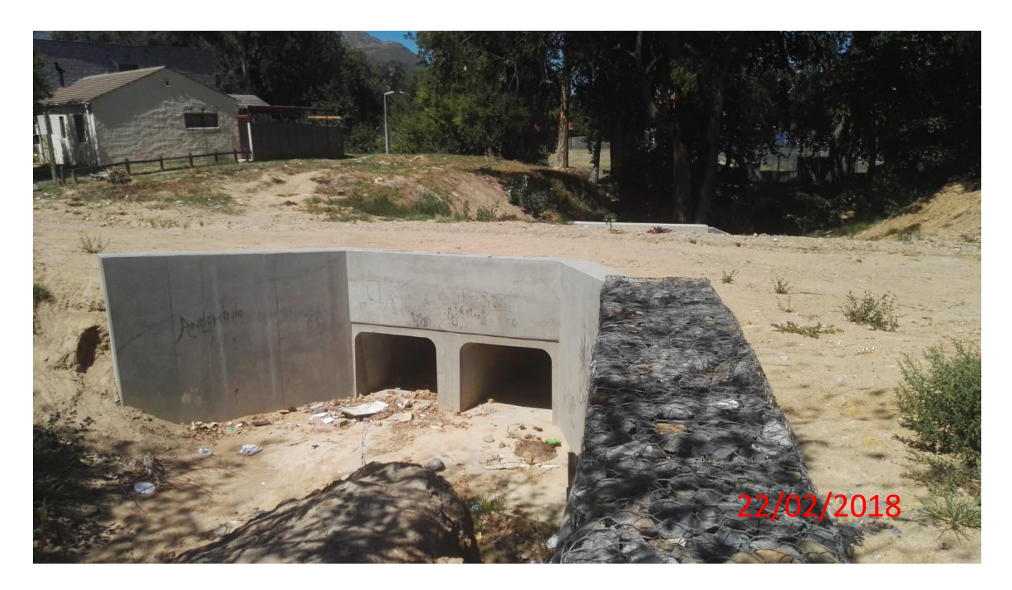
Photo 4: AFTER: Starting point of completed Gabion at Vehicle Bridge. Picture taken from east in a westerly direction