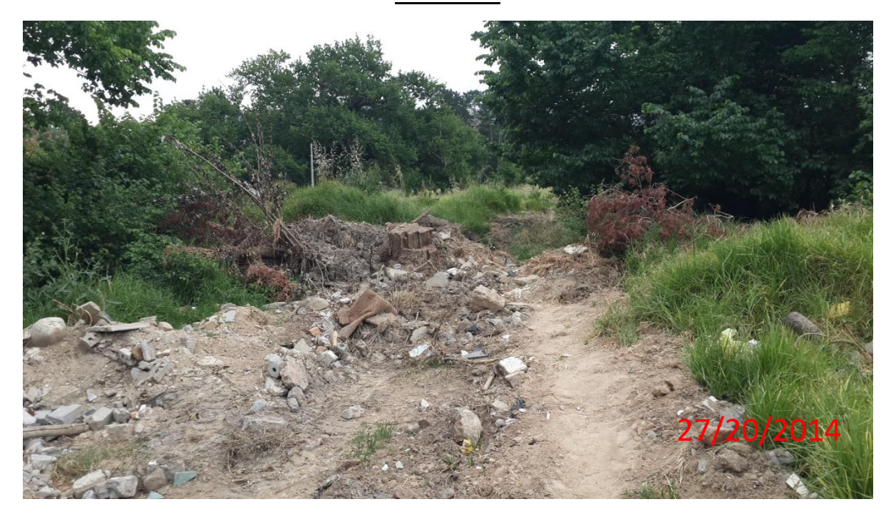
Photo1: BEFORE: Vehicle Bridge. Picture taken from east in a westerly direction.