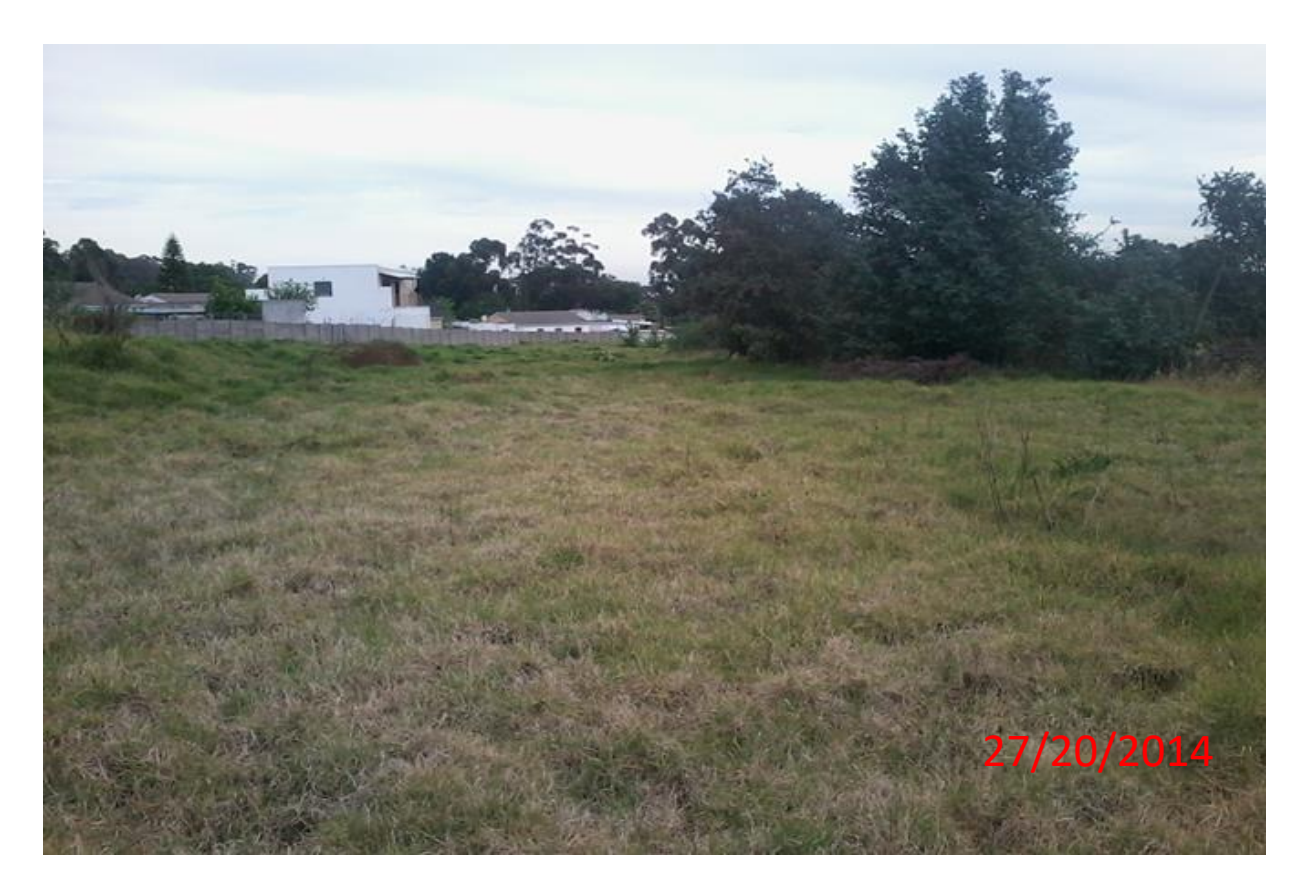
Photo3: BEFORE: River. Silted and covered with kikuyu grass.