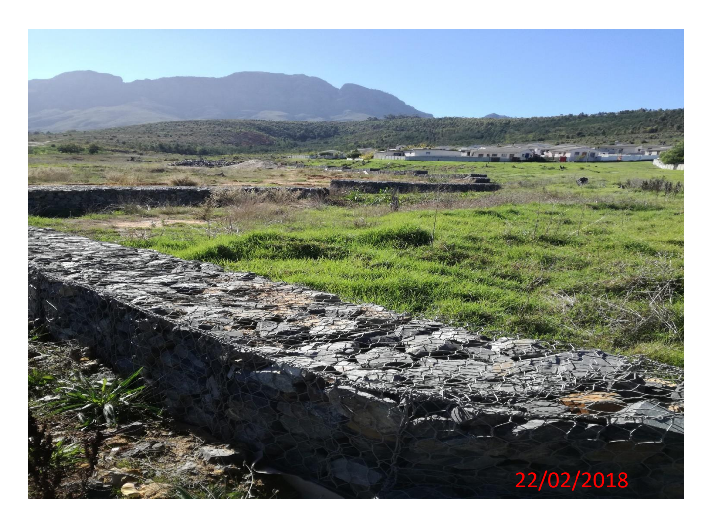
Photo 5: After: Completed Gabion. Picture taken from west in a north-easterly direction.