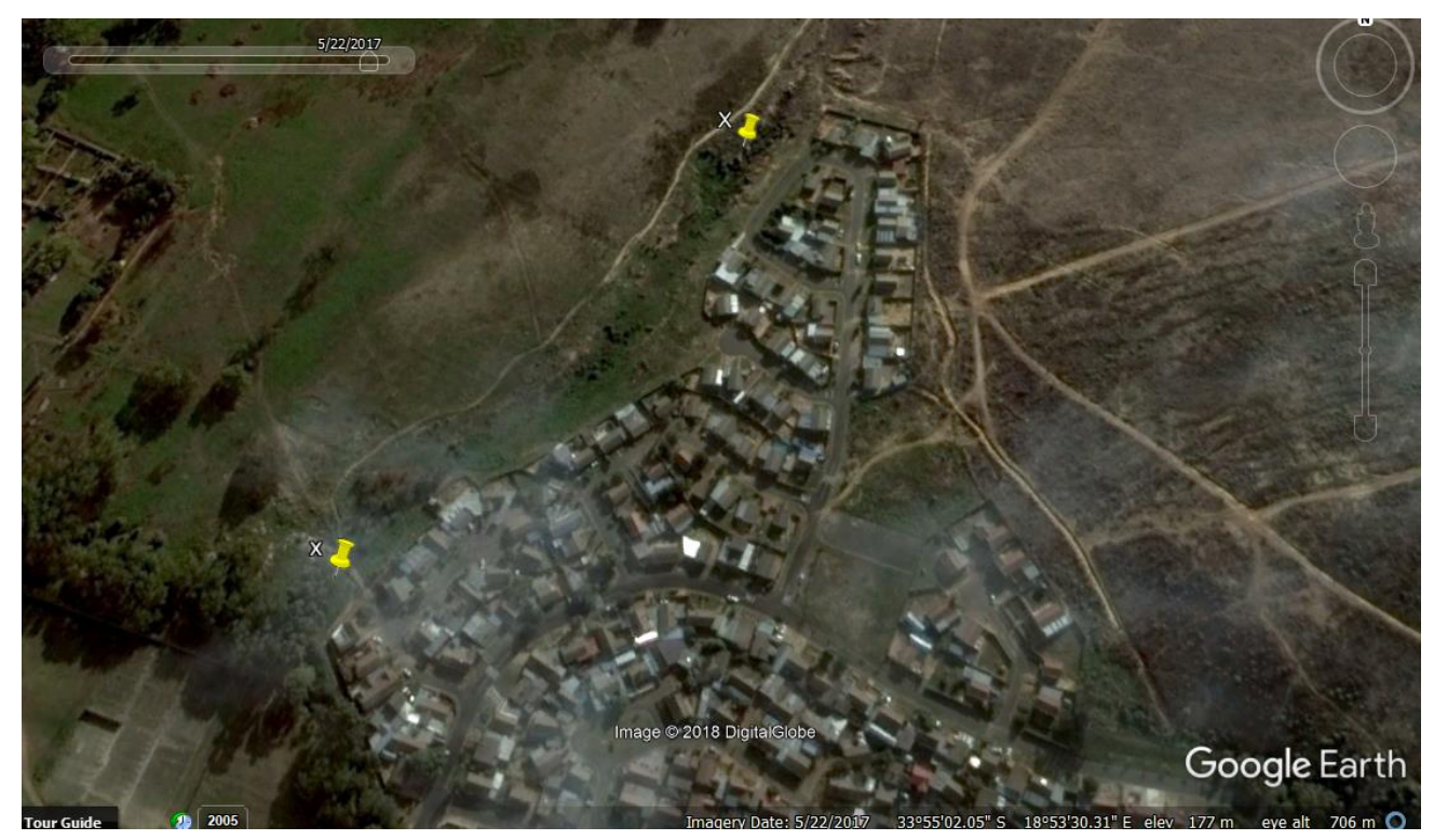
Image2: DATED 22 May 2017 (BEFORE)