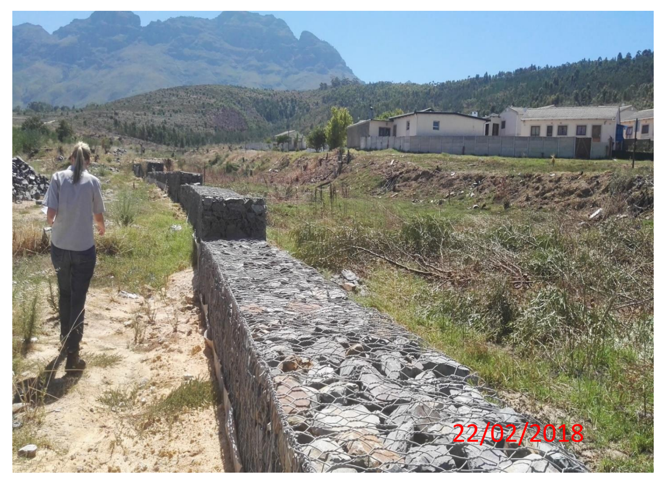
Photo 6: After: Completed Gabion. Picture taken from South in a north-easterly direction.