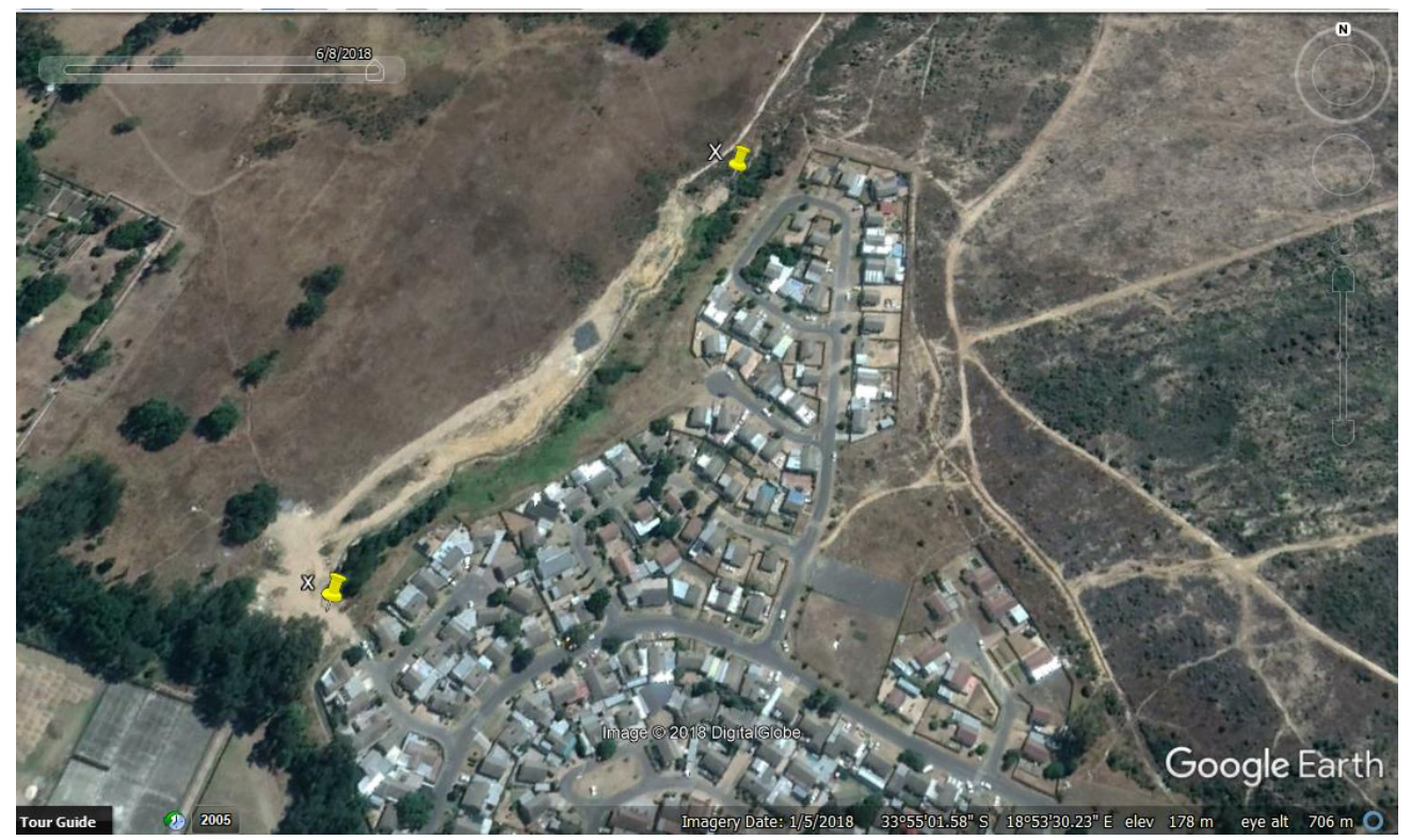
Image1: DATED 5 January 2018 (AFTER)