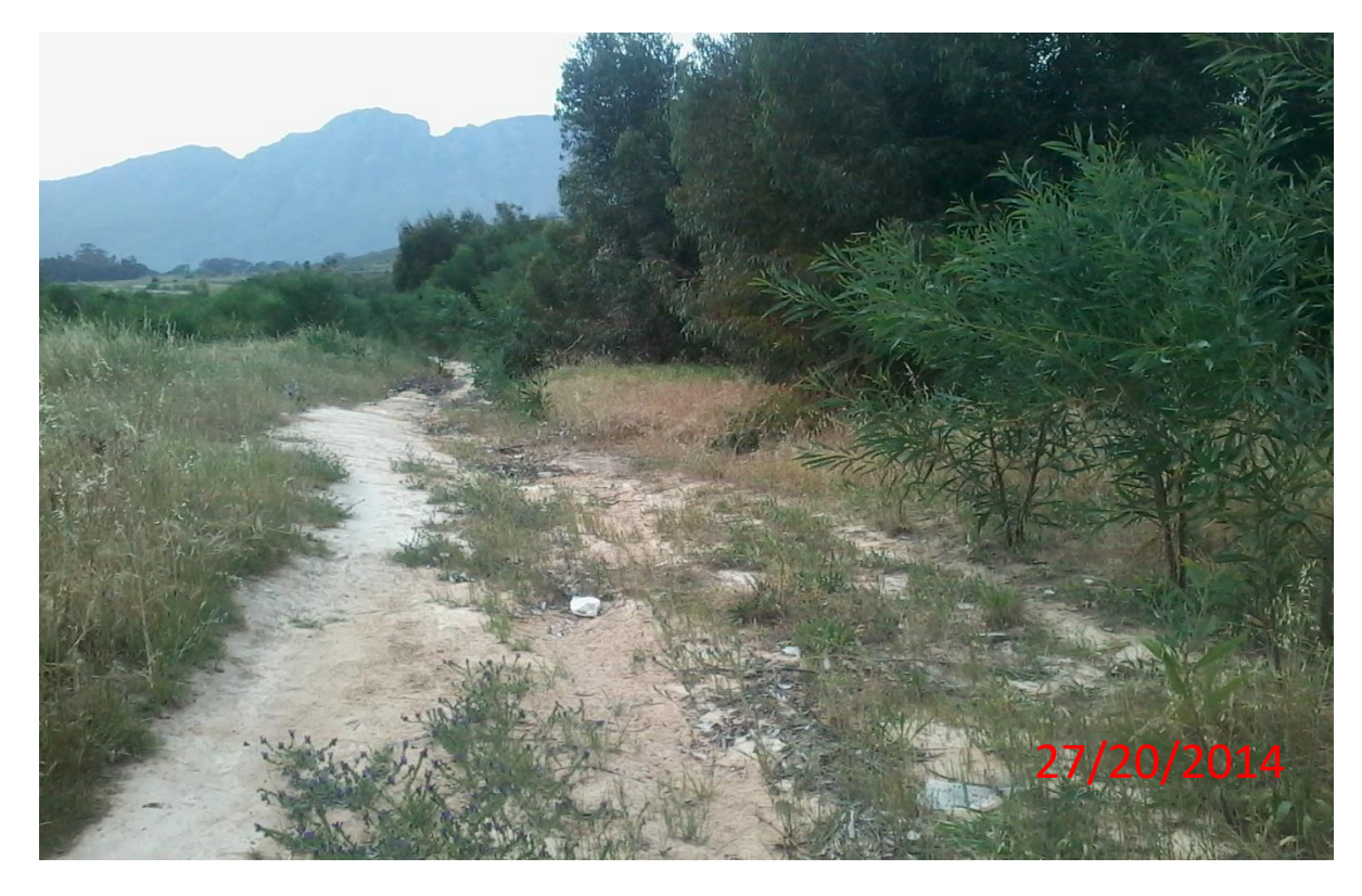
Photo2: BEFORE: River. Picture taken from west in a north-easterly direction.

Photo1: BEFORE: Vehicle Bridge. Picture taken from east in a westerly direction.