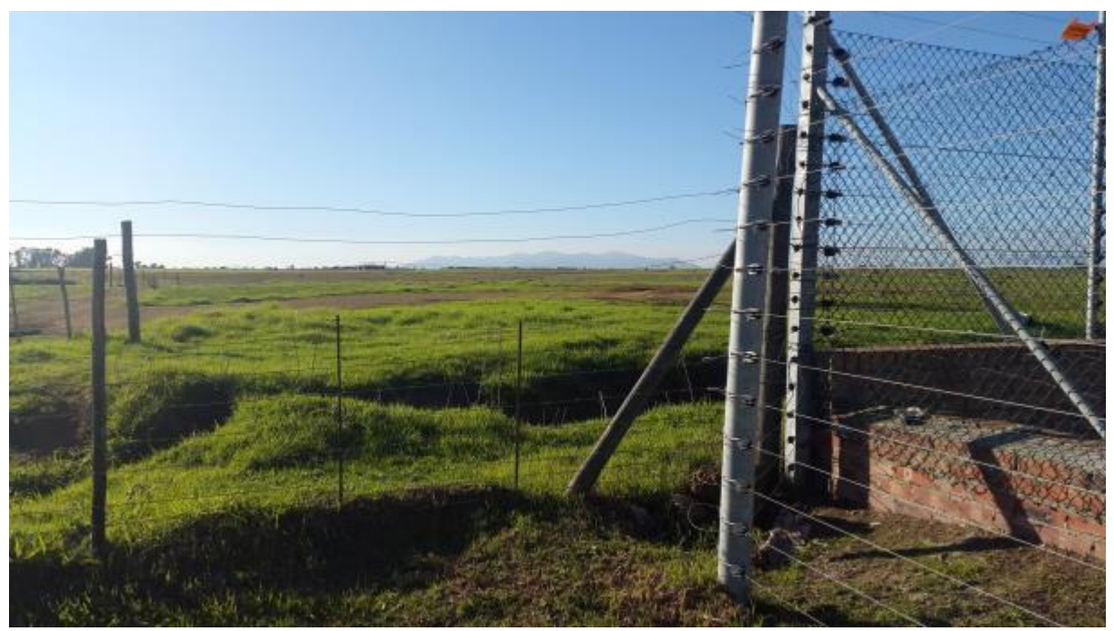
Photo 5: Abattoir and rendering facility northern boundary and land use