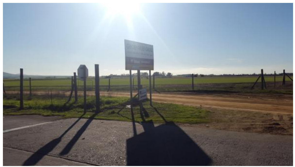
Photo 3: Abattoir and rendering facility northern boundary and land use