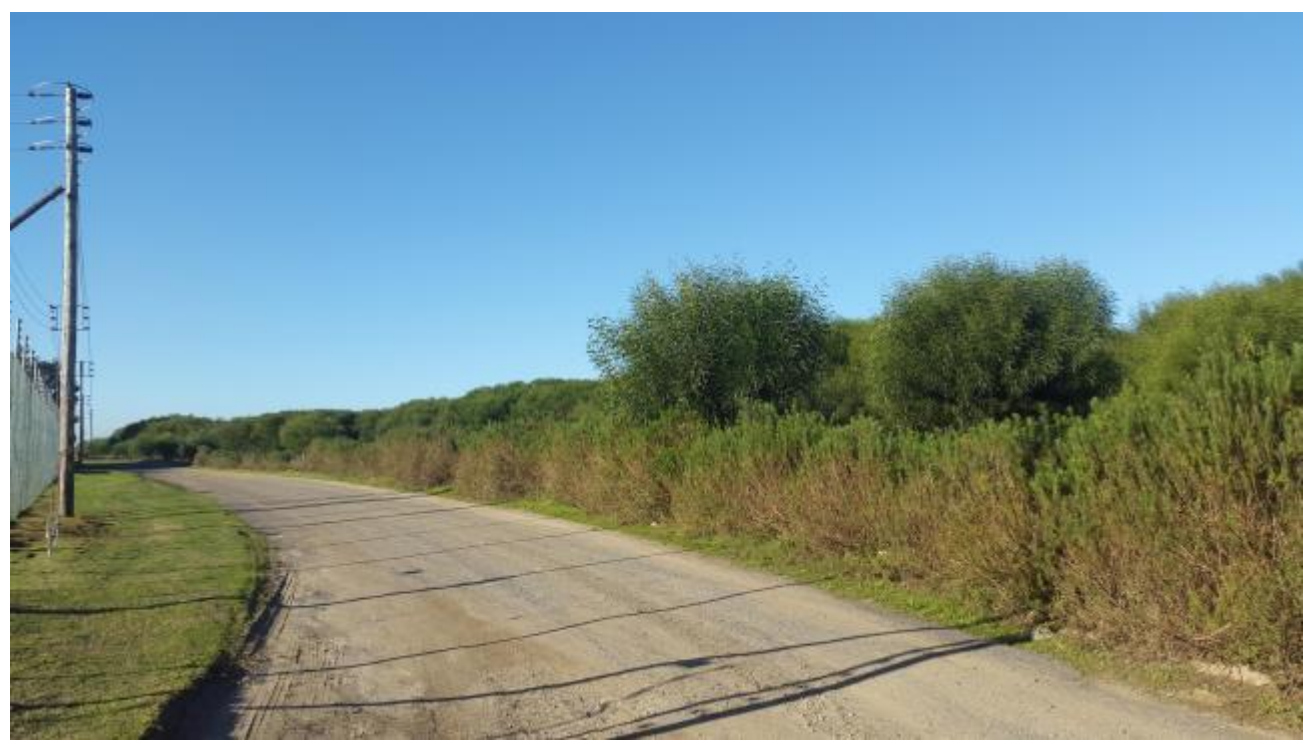
Photo 1: Abattoir and rendering facility southern boundary and land use