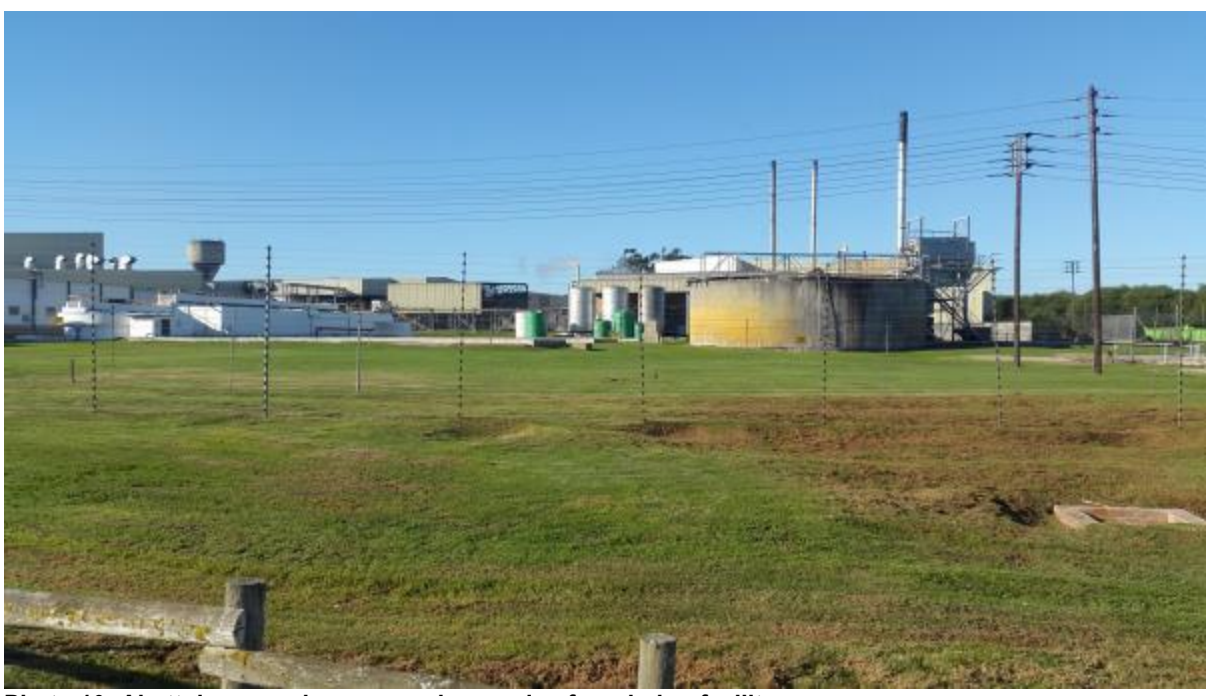
Photo 10: Abattoir expansion area and upgrade of rendering facility