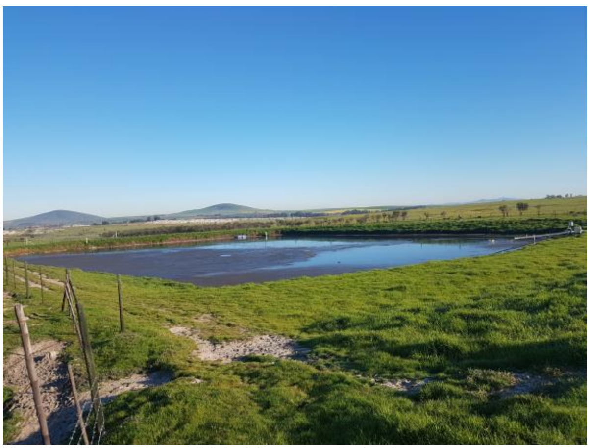
Photo 13: WWTW expansion area. Existing infrastructure to be altered.