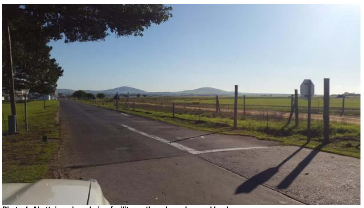
Photo 4: Abattoir and rendering facility northern boundary and land use