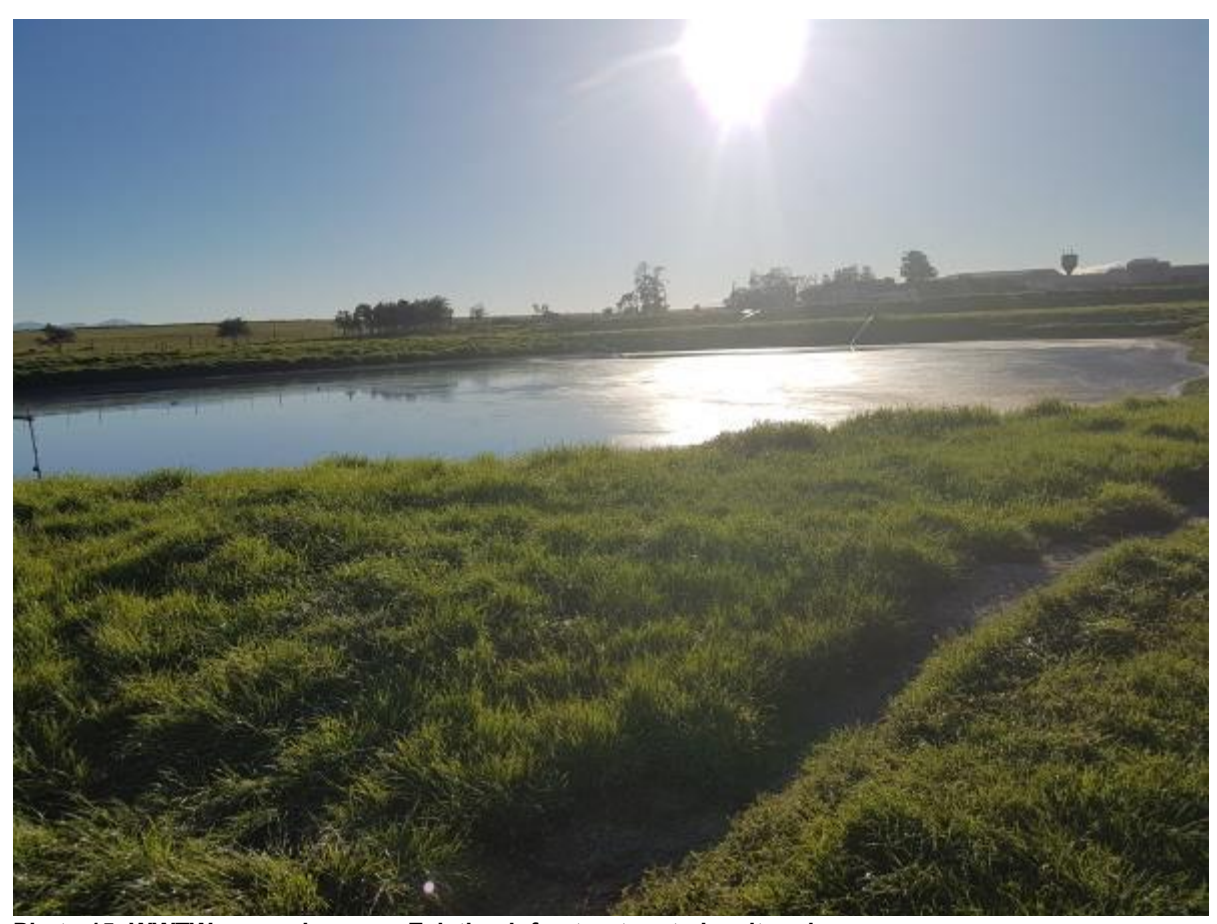
Photo 15: WWTW expansion area. Existing infrastructure to be altered.