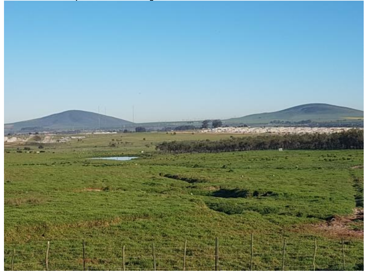
Photo 14: Stormwater expansion area. Existing infrastructure to be altered.

Photo 13: WWTW expansion area. Existing infrastructure to be altered.