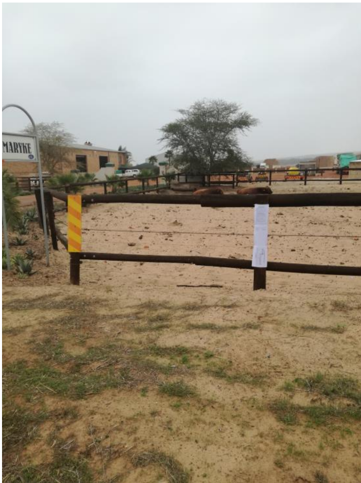
Site notice photo dated 2 May 2018.

Photos of the notice board are included below. The notice board was placed on site on 02 May 2018.