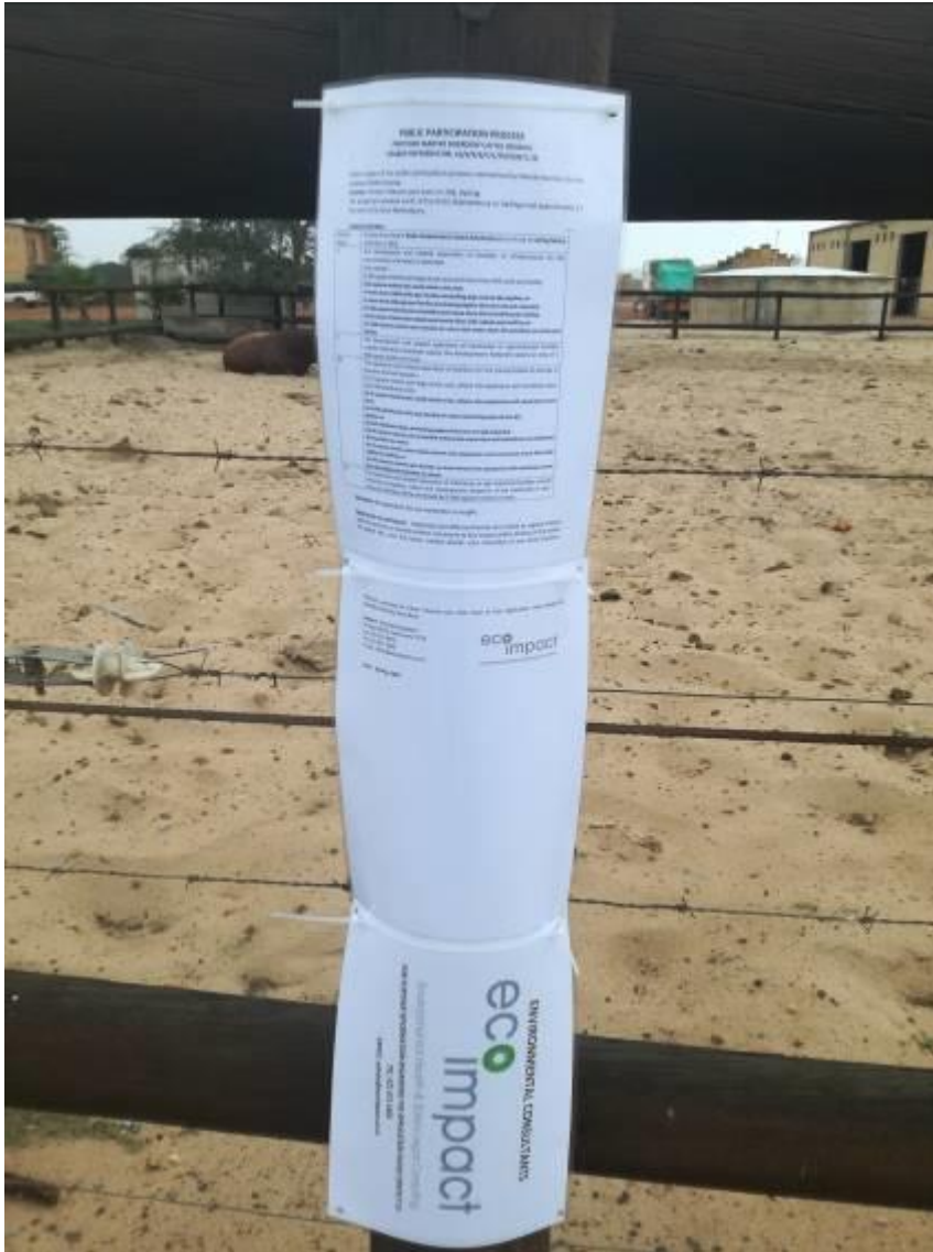
Site notice photo dated 02 May 2018.