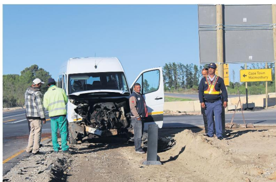
Dié taxi wat 22 studente na West Coast College in Malmesbury vervoer het, is Donderdag 3 Mei deur 'n vrugmotor getref. Al die passasiers het ligte beserings opgedoen.