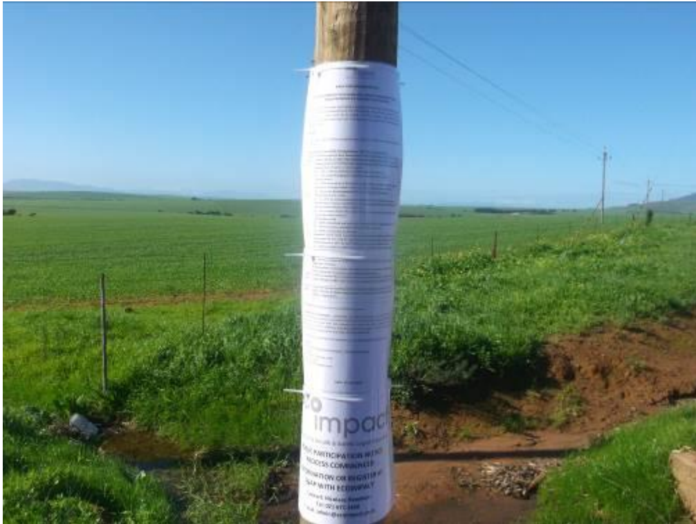
Site notice photo dated 03 July 2018.