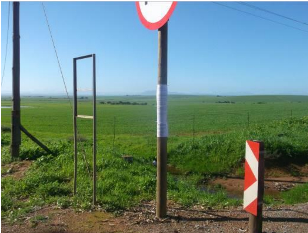
Site notice photo dated 03 July 2018.

Photos of the notice board are included below. The notice board was placed on site on 03 July 2018.