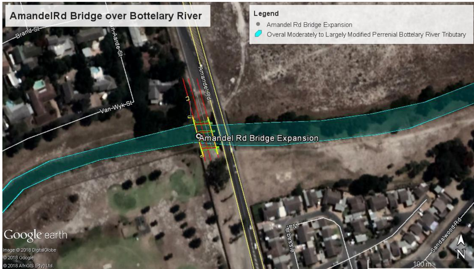
Biodiversity Map A1: Sensitive environmental features as recorded on the site and surrounds by specialists