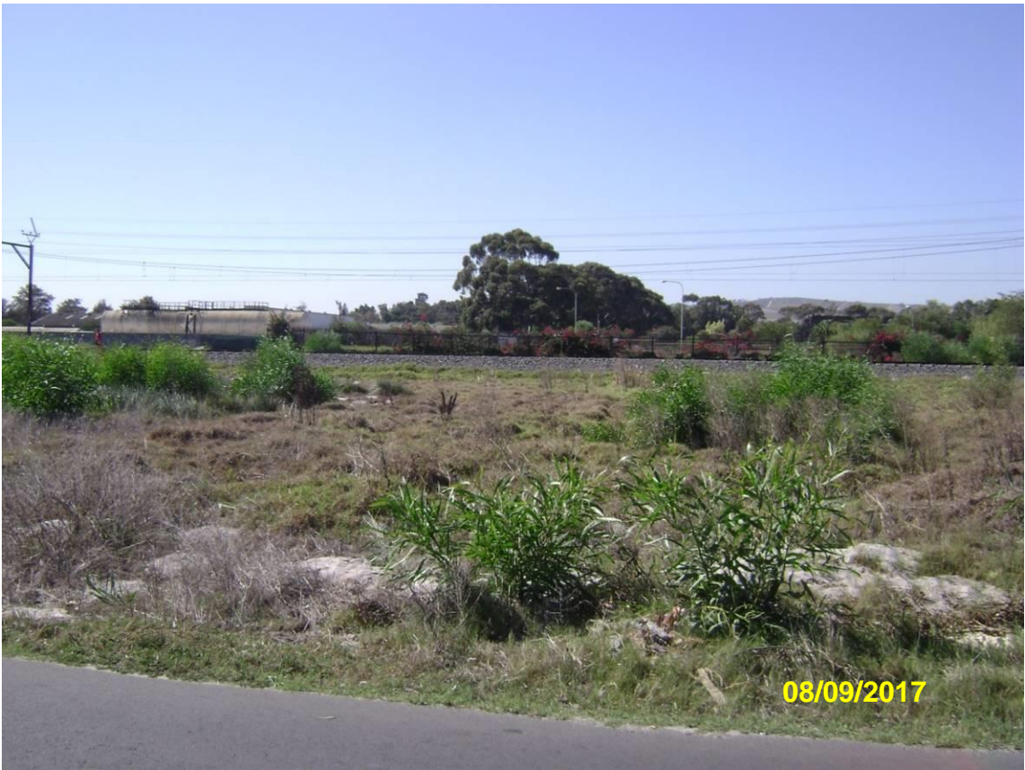
Photo 3: Proposed development site, where the new road will go over the railway line.