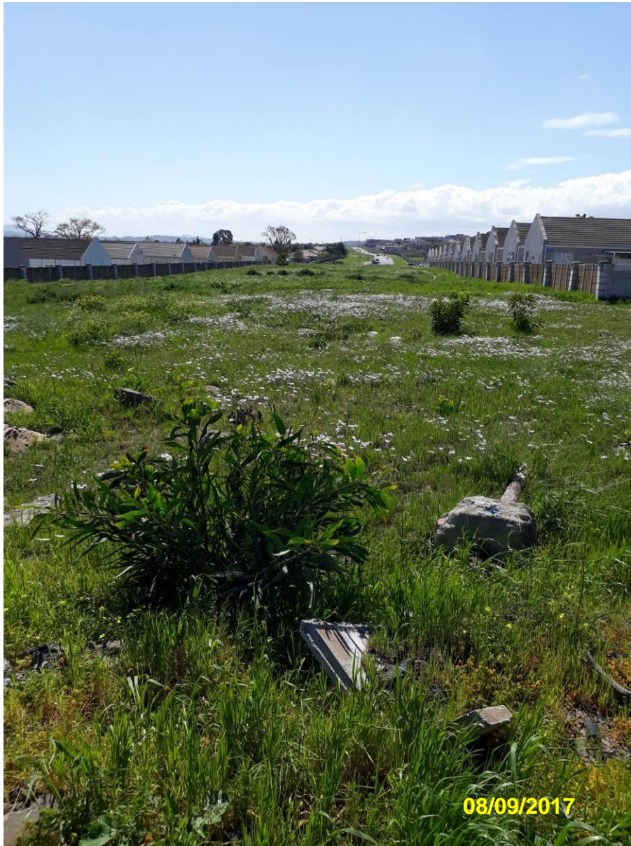
Photo 12: End of proposed new road development site where it will connect with Langverwacht Rd.