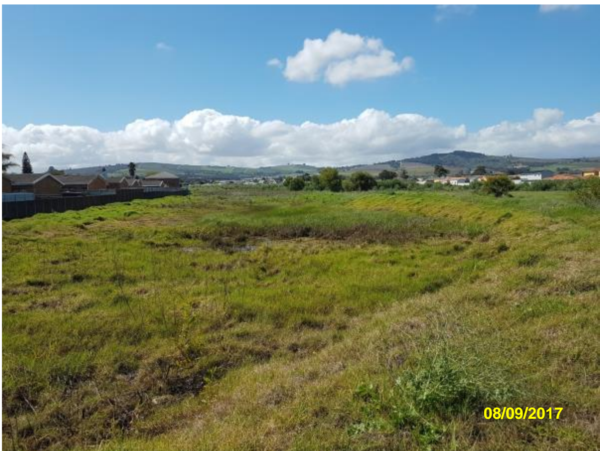
Photo 13.2: A section of wetland 2 which is proposed to be completely filled and development upon.