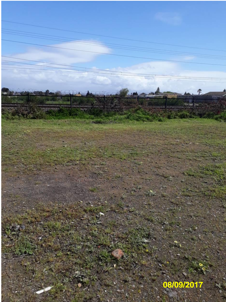
Photo 4: Proposed development site, where the new road will go over the railway line at the Cisco industrial property.