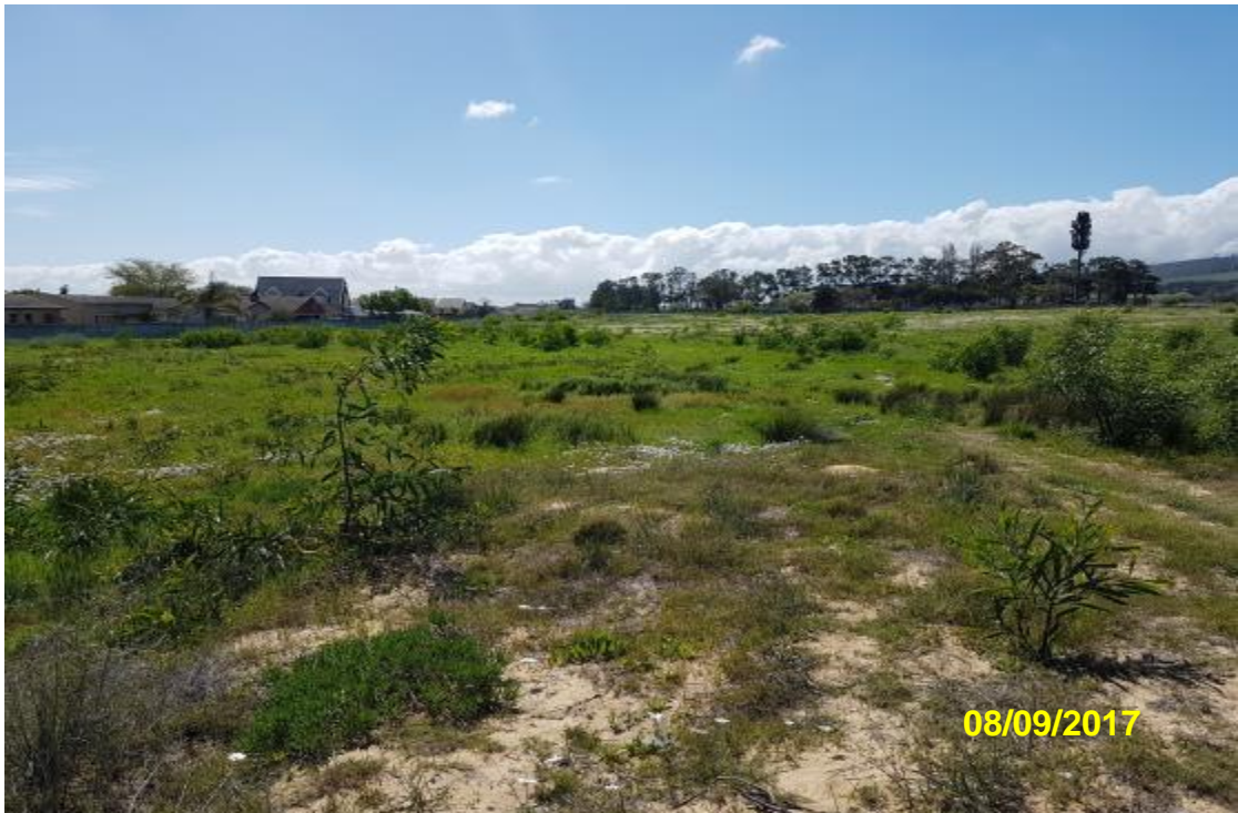
Photo 14.1: View of Wetland 4 that will be partially filled and impacted upon.