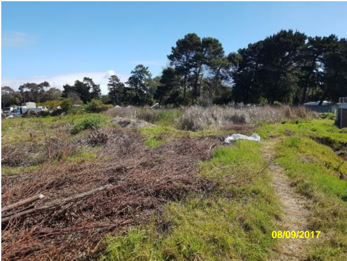
Photo 13.1: A section of wetland 2 which will be partially filled and developed upon.