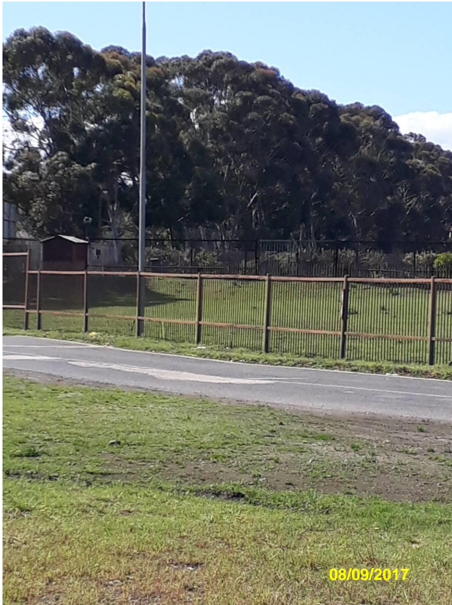
Photo 5: Proposed development site at the Cisco industrial property.