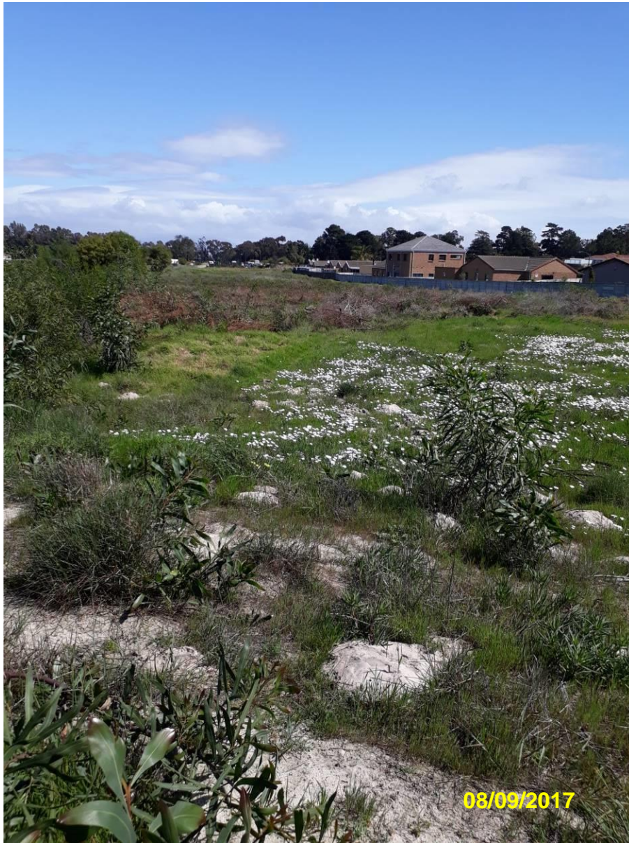
Photo 9: Proposed development site with seasonal wetland that will be partially filled during the proposed development.