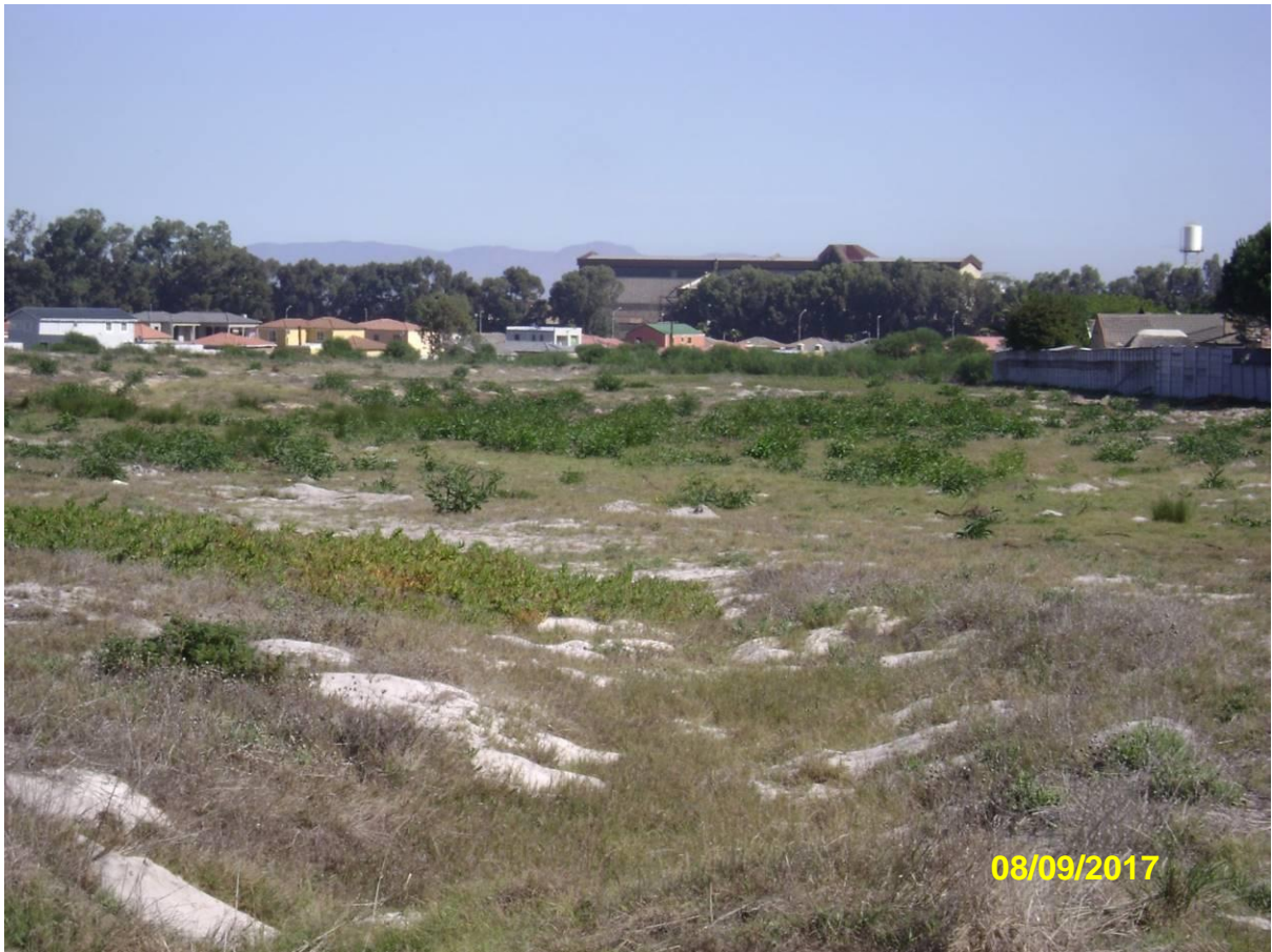
Photo 1: Start of new road at location where it will eventually connect with Belhar Main Rd.