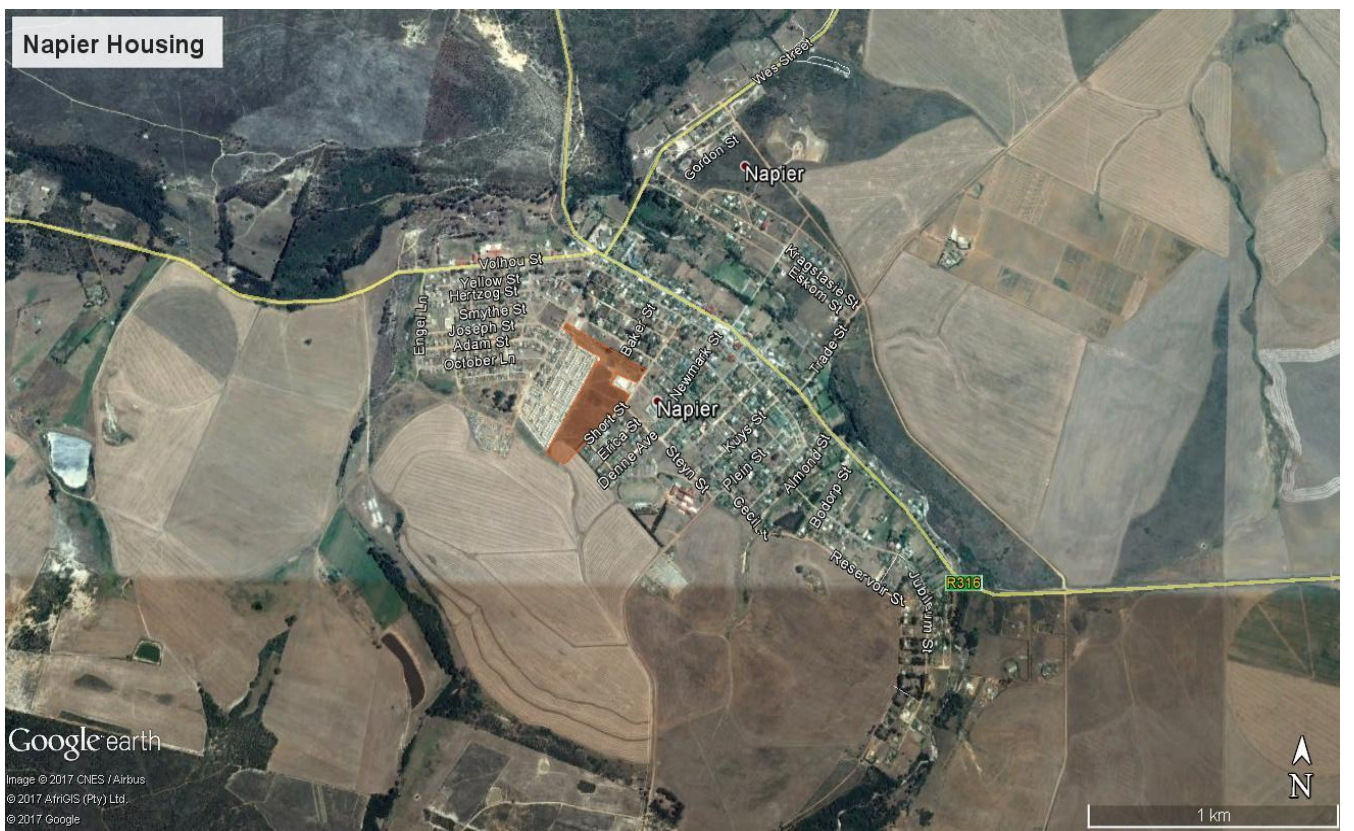
Map 1.2: Indicating locality of the 7.8ha surveyed site at Napier