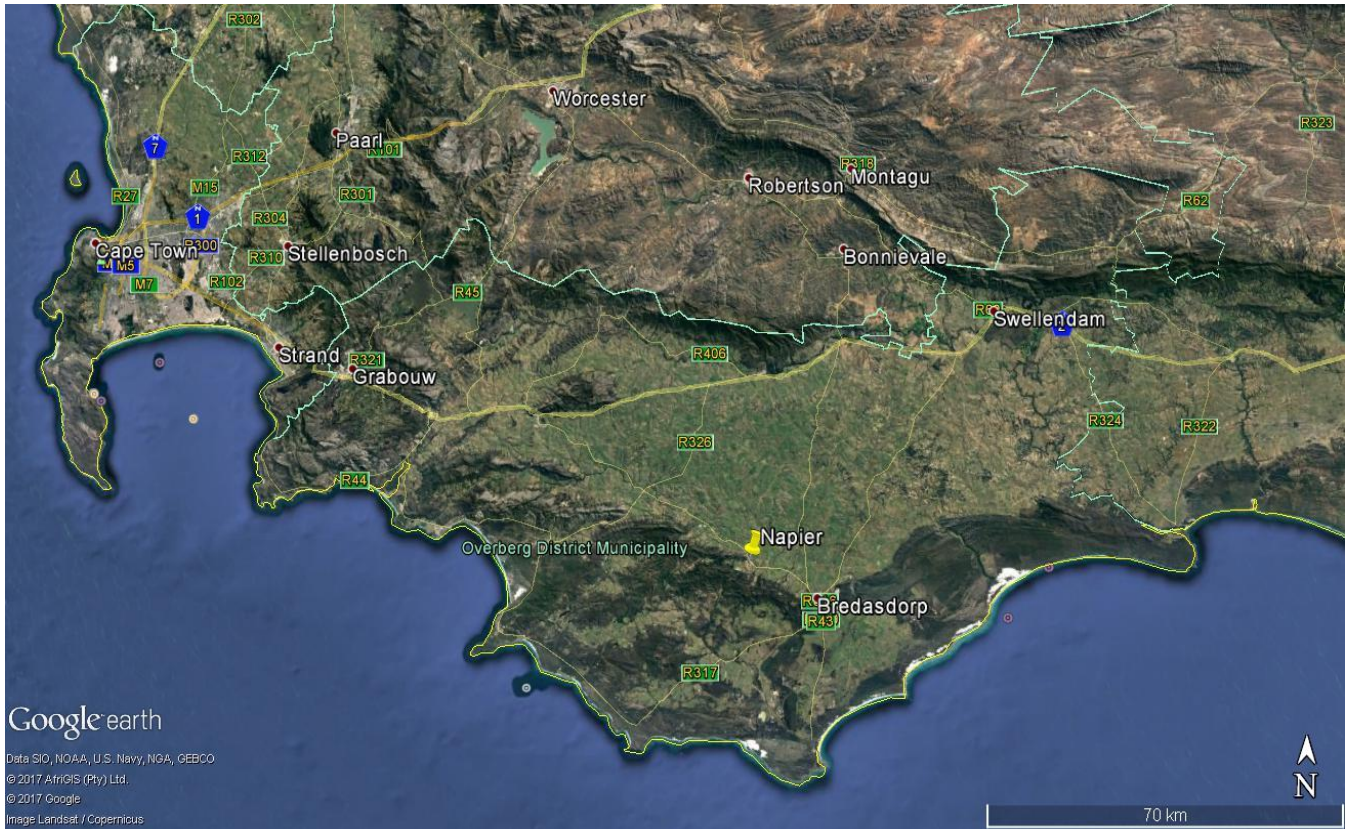
Map 1.1: Napier locality in the Western Cape.