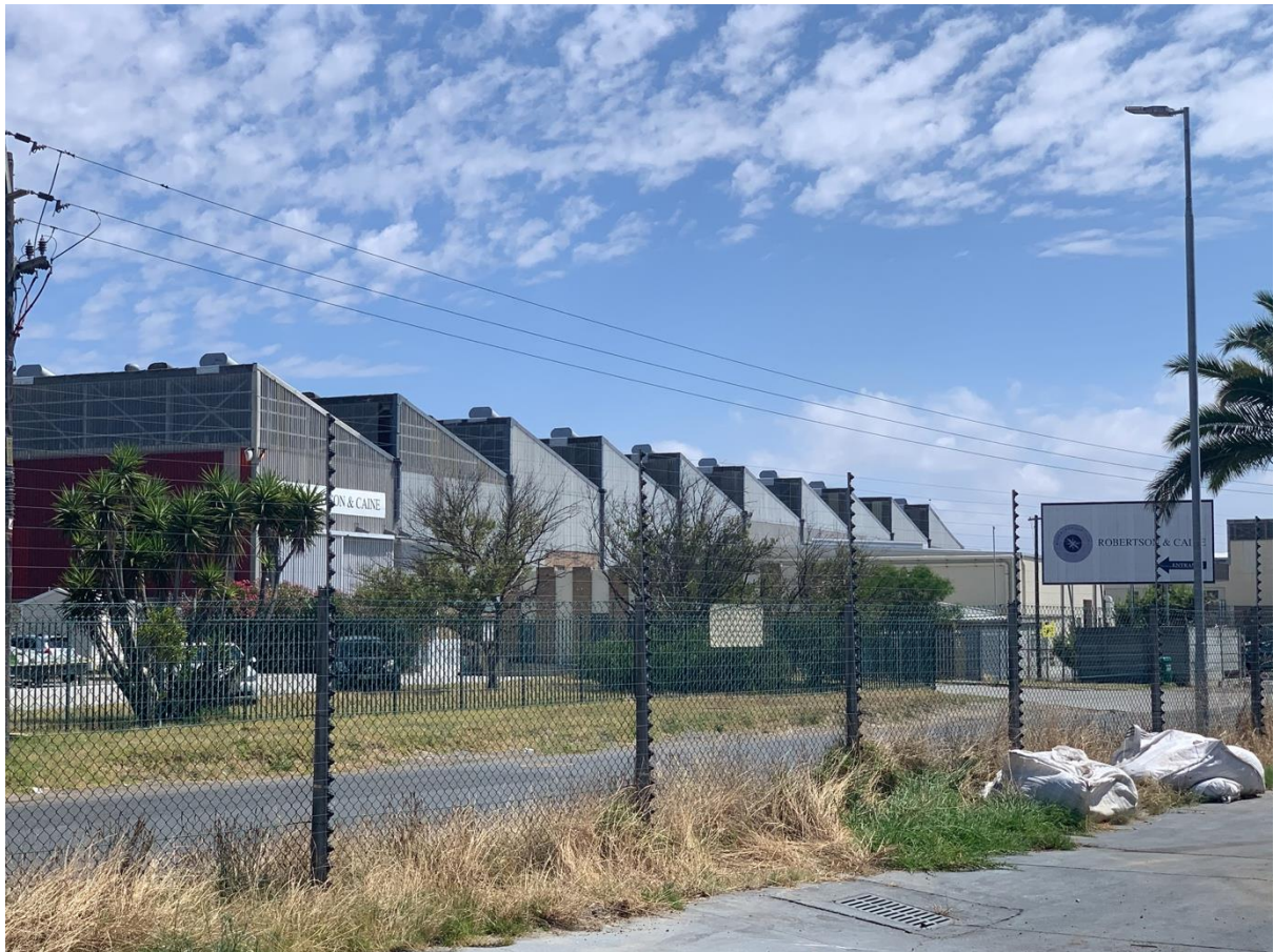
Pic 14: Eskom Transformer. Note site plan indicates this is on a separate "Erf".