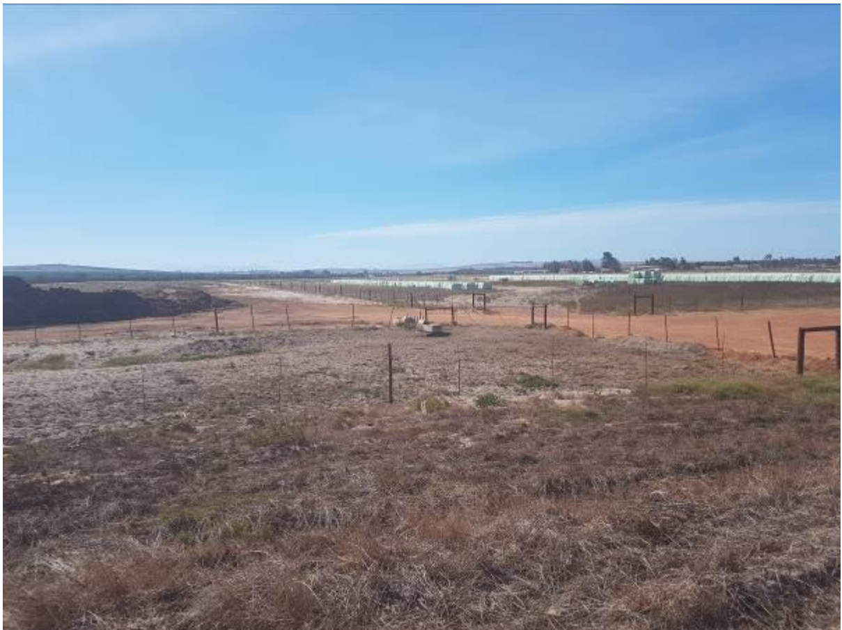
Photo 3: New Cattle housing Infrastructure and manure effluent pond expansion area