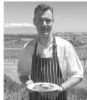
Longridge Langtafel open-air dinner.

This will be followed by a delectable cheese board featuring Delaware Island brie, honey-roasted goat cheese, parmesan and pickles, accompanied by the