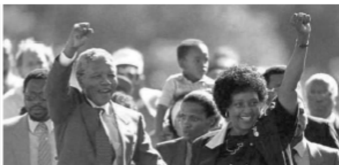
Nelson Mandela, accompanied by his then wife Winnie, triumphantly walks free after 27 years' incarceration.

Many children are still sitting at home 22 days after the school year started, because there is no space for them in local schools.