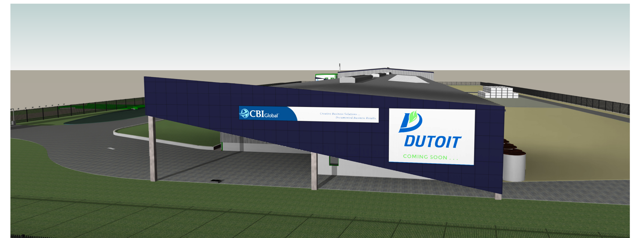
2 PERSPECTIVE - East Facade