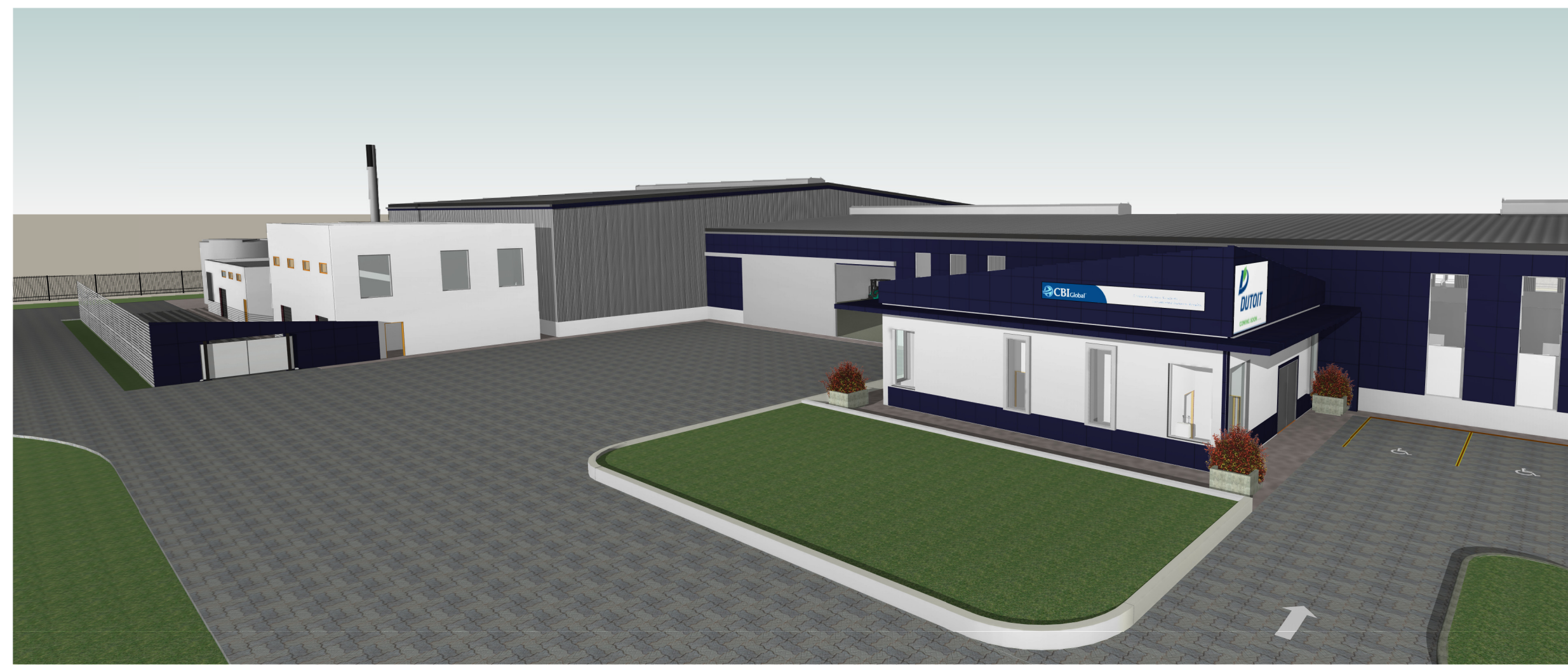
1 PERSPECTIVE - Offices