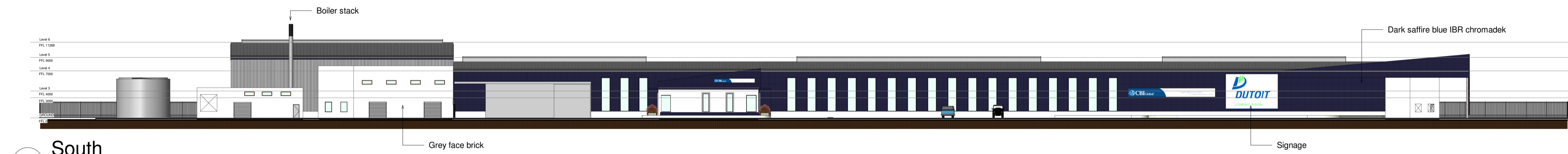
2 South 1 : 350