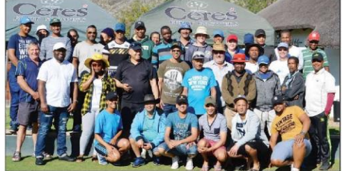
CERES Fruit Growers se ingenieursafdeling het Woensdag 31 Oktober hul jaarlikse spanbou-sessie by die Ceres rolbalkklub aangebied.