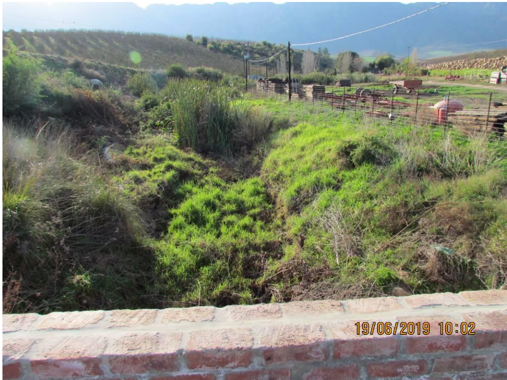
Photo 3: Upstream view of non-perennial river, photo taken June 2019