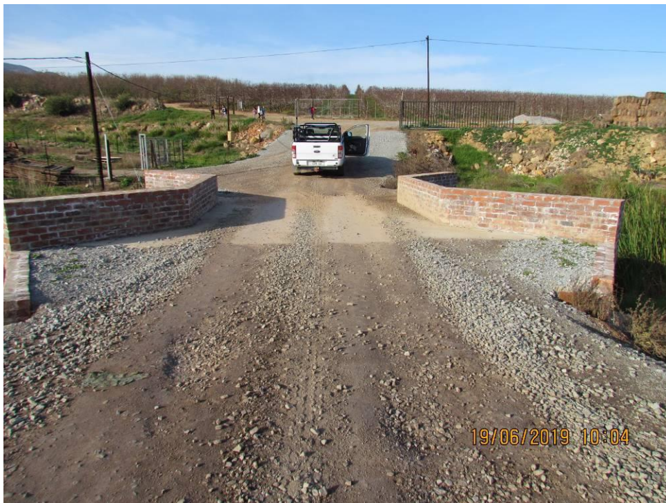
Photo 2: Bridge crossing over section of non-perennial river, photo taken June 201