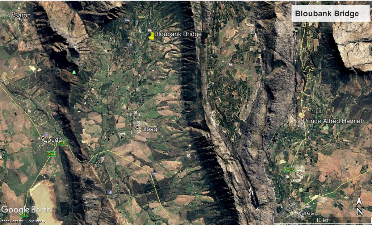
Maps 1.1 and 1.2: Location of the Bloubank Bridge constructed on Portion 1 of Farm Bloubank No 52, near Tulbagh